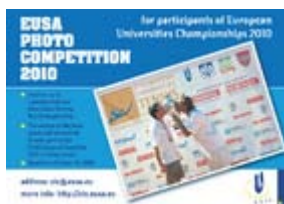
Photo Competition 2010 - 3 September 2010

Share your own perspectives of this year's EUSA Championships and sporting events. Today we are particularly concerned with creating positive results through youth sport experiences. Youth sports play an important role in the development of a new and more talented generation.